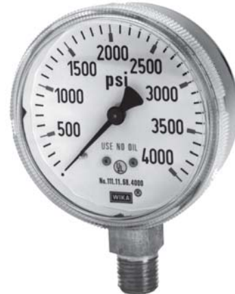
Bourdon Tube Pressure Gauge Type 131.15

Additional error when temperature changes from reference temperature of 68°F (20°C) ±0.4% for every 18°F (10°C) rising or falling. Percentage of span.