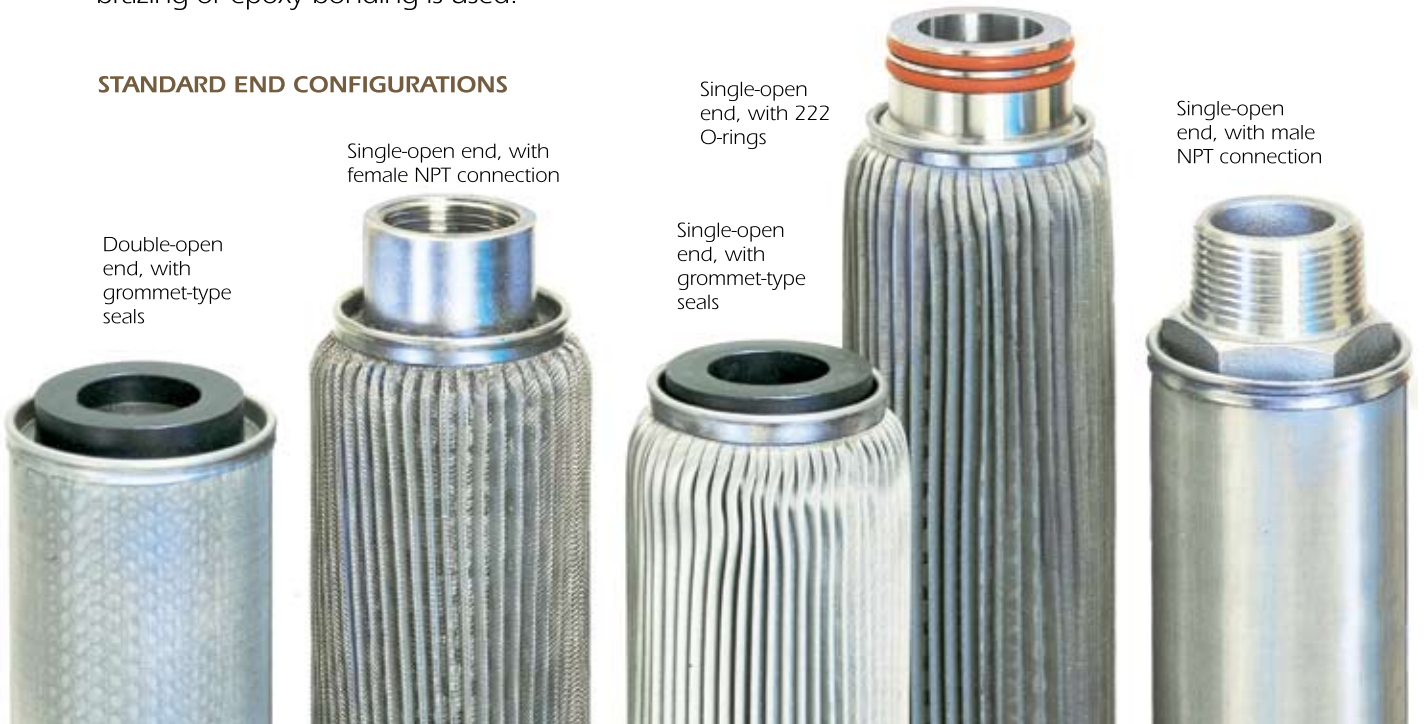
Double-open end, with grommet-type seals