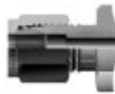
Z -Single ferrule CPI ™ compression port