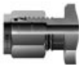
A -Two ferrule A-LOK ® compression port