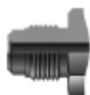
V -VacuSeal face seal port