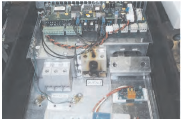
Photo 4, Arcing Caused by Loose Output Contacts