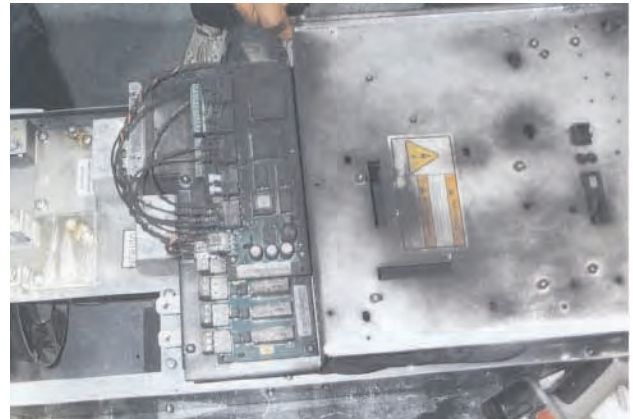
Photo 1, Fan Injecting Dust into Drive Enclosure

Most VFDs fall into the NEMA 1 category (side vents for cooling airflow) or NEMA 12 category (sealed, dust-tight enclosure). Drives that fall in the NEMA 1 category are susceptible to dust contamination. Dust on VFD hardware can cause a lack of airflow, resulting in diminished performance from heat sinks and circulating fans (Photo 1).