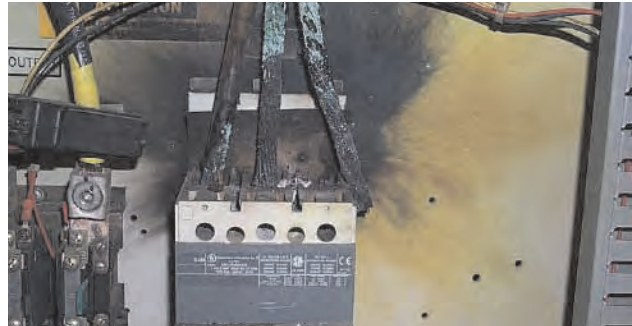
Photo 3, Arcing Caused by Loose Input Contacts

Loose control wiring connections can cause erratic operation. For example, a loose START/STOP signal wire can cause uncontrollable VFD stops. A loose speed reference wire can cause the drive speed to fluctuate, resulting in scrap, machine damage, or personnel injury.