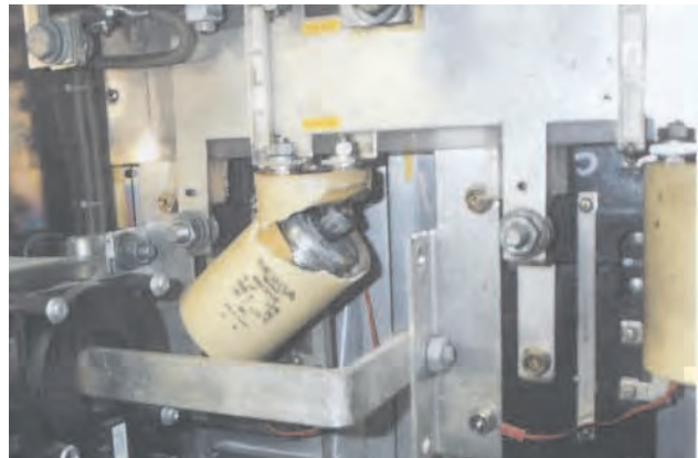
Photo 6, Capacitor Failure

4. What about spare VFDs? Store them in a clean, dry environment, with no condensation allowed. Place this unit in your PM system so you know to power it up every 6 months to keep the DC bus capacitors at their peak performance capability. Otherwise, their charging ability will significantly diminish. A capacitor is much like a battery-it needs to go into service soon after purchase or suffer a loss of usable life.