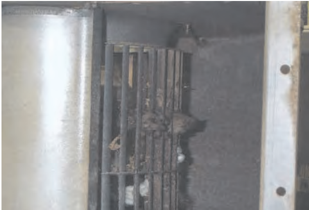
Photo 5, Foreign Object in Fan

2. Inspect DC bus capacitors for bulging and leakage. Either could be a sign of component stress or electrical misuse. Photos 5 and 6 show fan and capacitor stress problems.