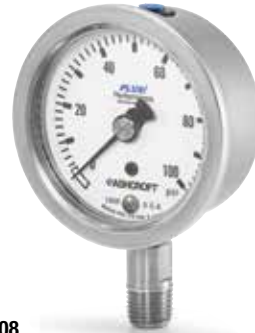
1008 63mm dial size