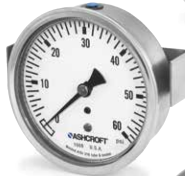
1008 100mm dial size