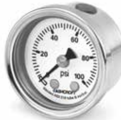
1008S 40mm dial size Back connection