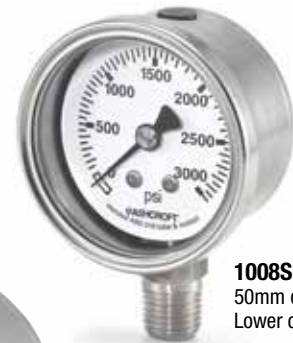
1008S 50mm dial size Lower connection