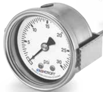
1008S 50mm dial size Center back connection with U-clamp