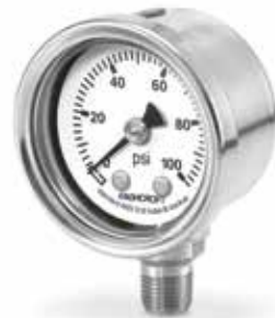
1008S 40mm dial size Lower connection