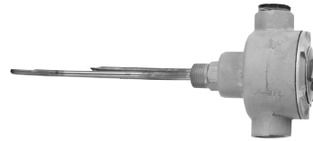
E2 — Dimensions (Inches)